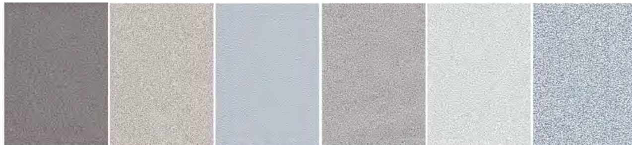
Battleship Crepe 17013315 Grey Twist 17010696 Platinum Crepe 17010911 Taupe Twist 17010898 Sky Twist 17010899 Navy Twist 17013547